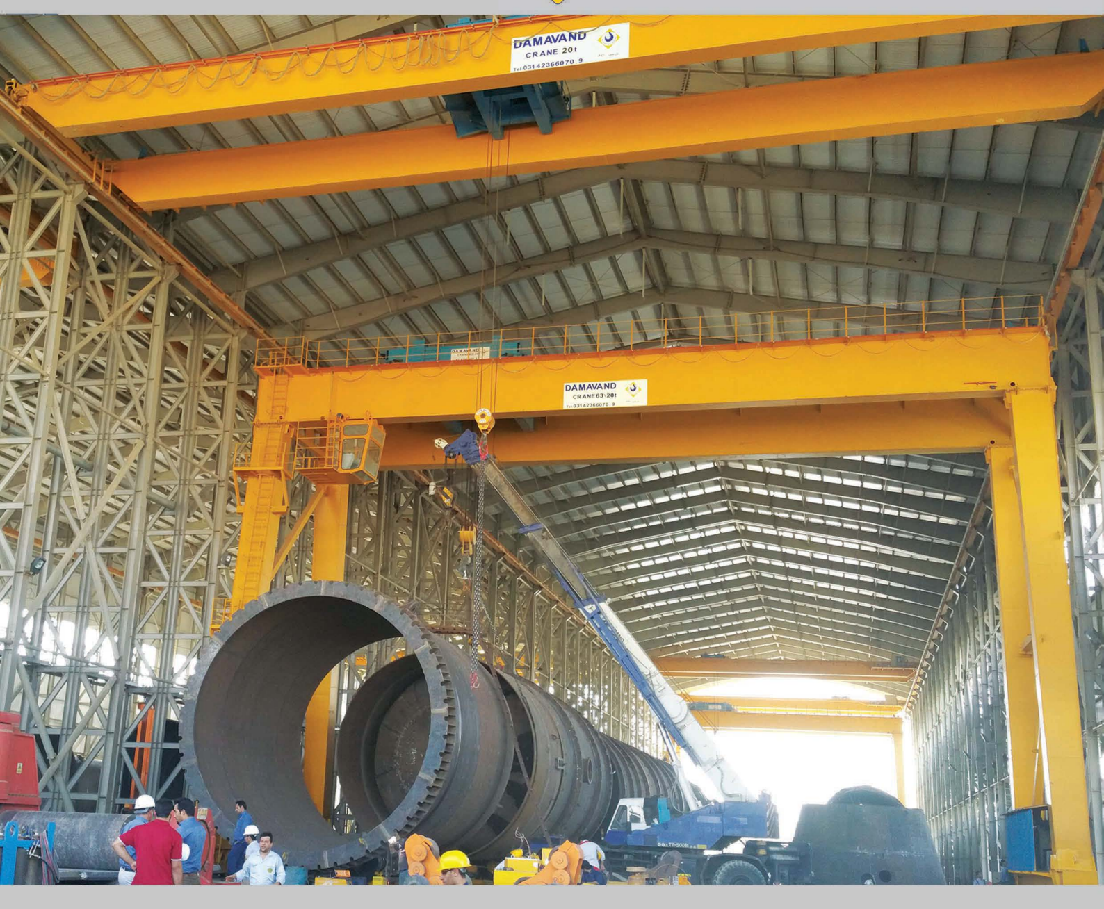
Capacity: Gantry Crane 63/20 Tons, class: M6, Span: 31m, Height: 18m.